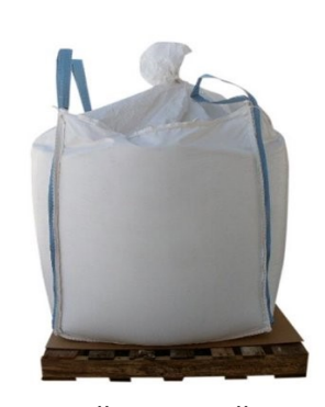
2000 lb to 3000 lb Bags